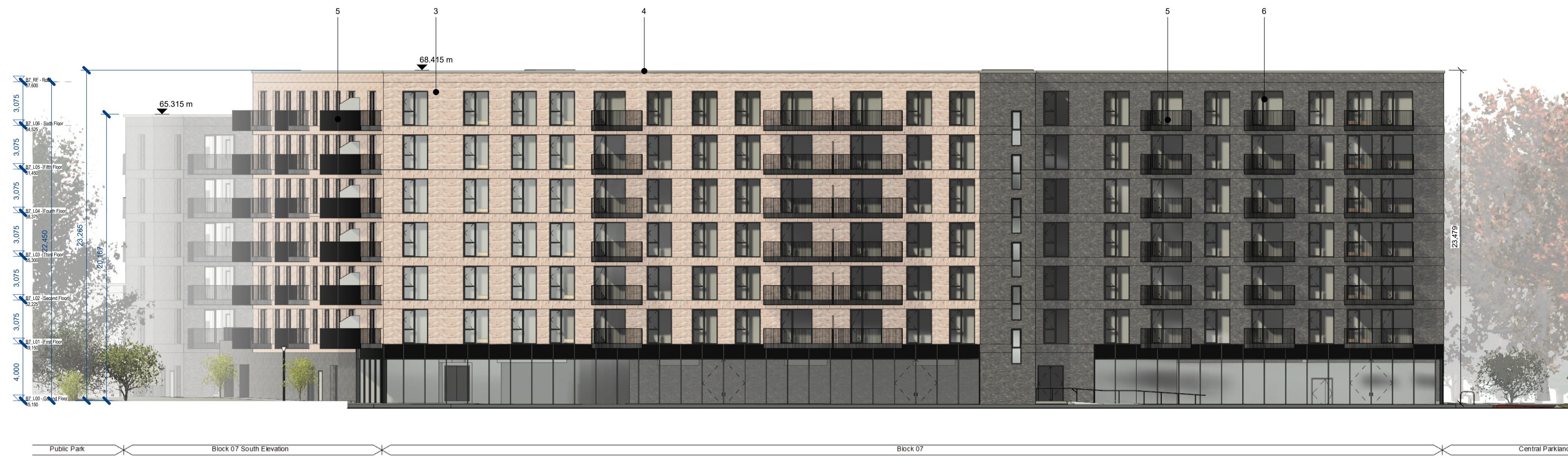
East Elevation 1 : 200