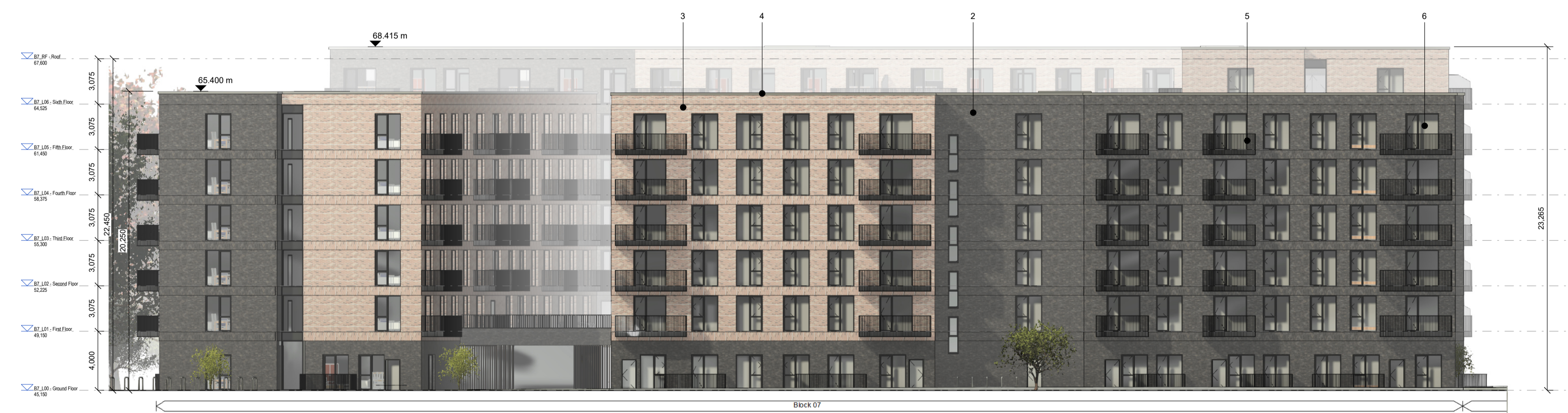
West Elevation 1 : 200

Notes: - Do not scale from this drawing. Use figured dimensions in all cases. - Verify dimensions on site and report any discrepancies to the Architect immediately. - This drawing is to be read in conjunction with the Architect's Specification. - © This drawing is copyright and may only be reproduced with the Architect's permission.